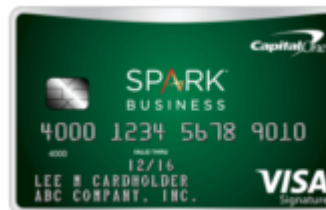
Capital One® Spark® Business Cash Apply Now Learn More