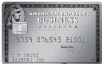
Business Platinum® Card Apply Now Learn More