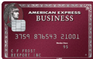
Plum Card® from American Express Apply Now Learn More